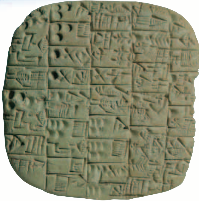
▲ Cuneiform tablet with the text of the introduction to the Code of Hammurabi