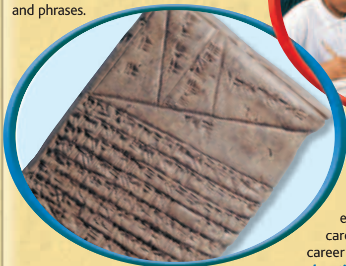
▲ Mesopotamian cuneiform tablet

PAST In ancient Mesopotamia, only boys from wealthy and high-ranking families went to the edubba , which means "tablet house." At the edubba —the world's first school—boys studied reading, writing, and mathematics and trained to be scribes. For hours every day, they copied the signs of the cuneiform script, trying to master hundreds of words and phrases.