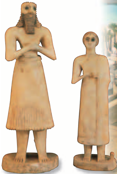
▲ Statues of Sumerians

How did people reach the upper levels of the ziggurat?