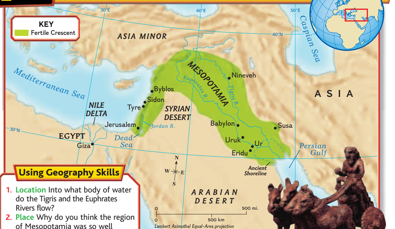
Sculpture of chariot from Mesopotamia