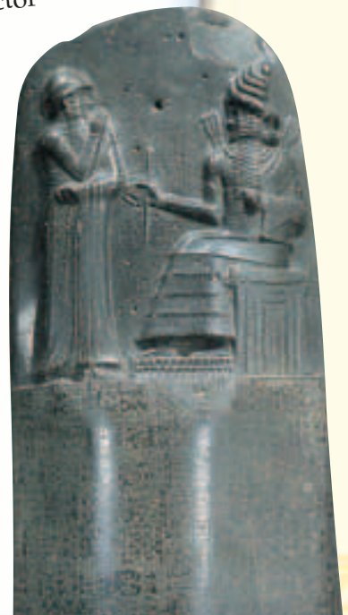
Stone monument showing Hammurabi (standing) and his code